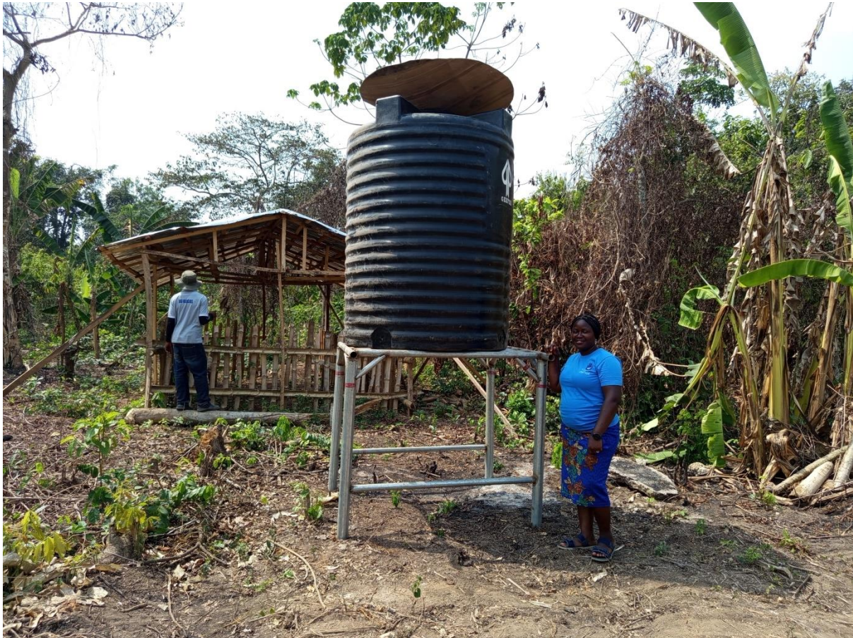
Rainwater Harvesting Kit on our demo farm

"We are a step closer to solving water issues if we manage the ones we already have."