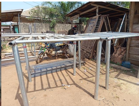
Rainwater Harvester constructed