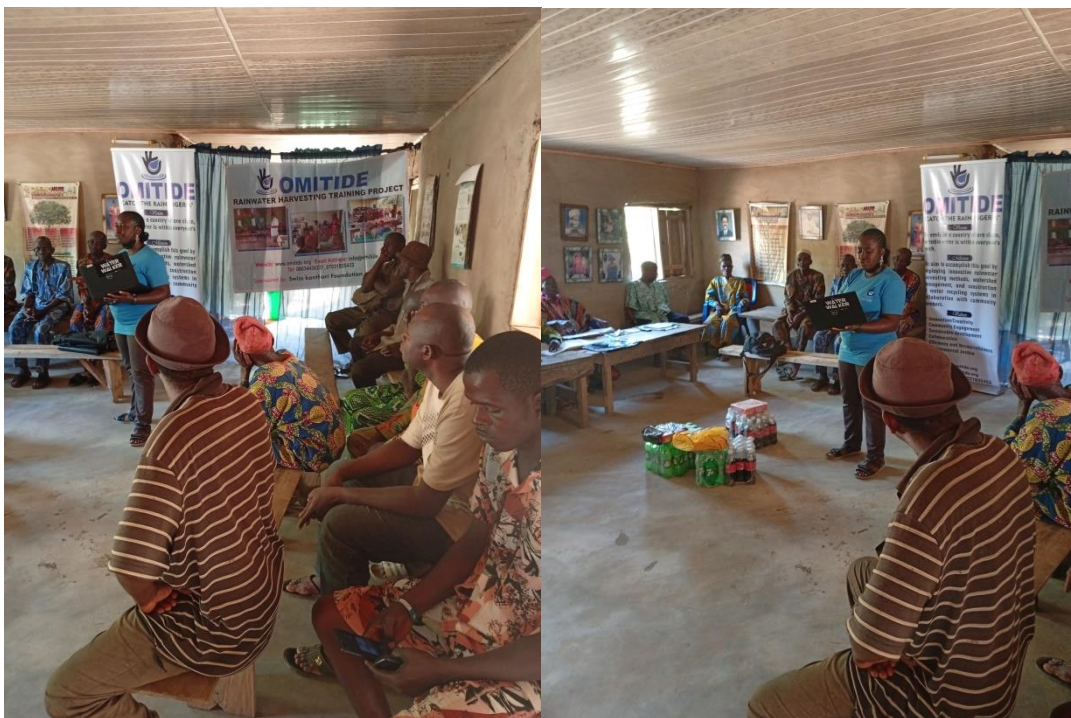
Rainwater Harvesting Training Session

Our rainwater harvesting training is still in progress. The training of the 150 farmers will be completed in the next quarter and we will be expanding to other communities.