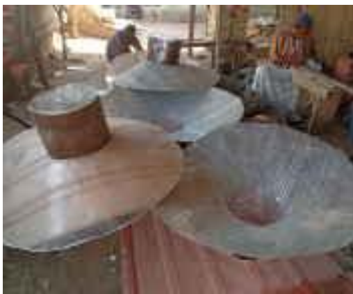
Constructed Tank Stands