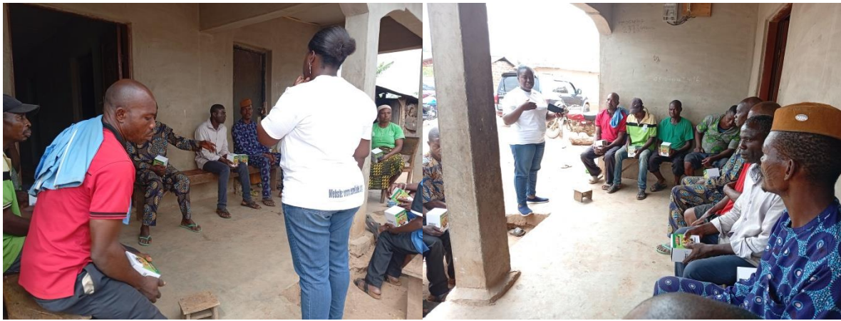
Rainwater Harvesting Training Session