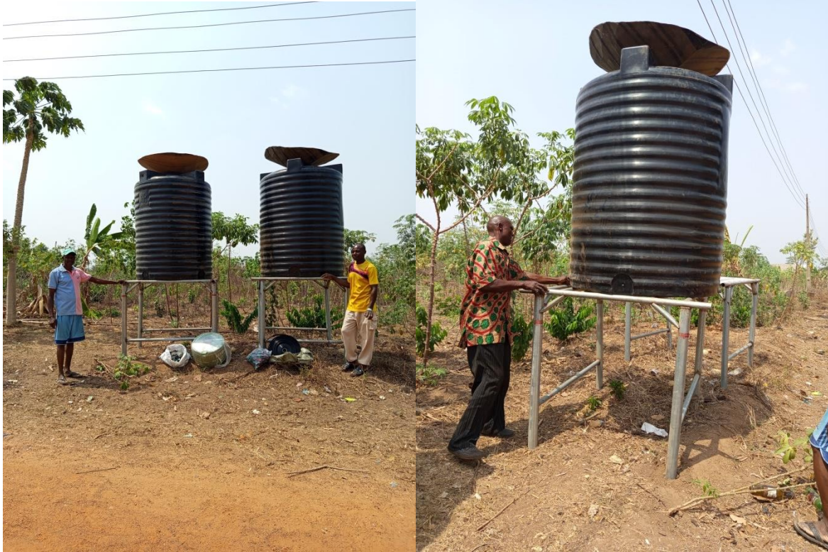
Farmers receiving their kits.

We have distributed rainwater harvesting and irrigation kits to the first 50 farmers trained. All thanks to God that the rains are here and they have started harvesting rainwater.