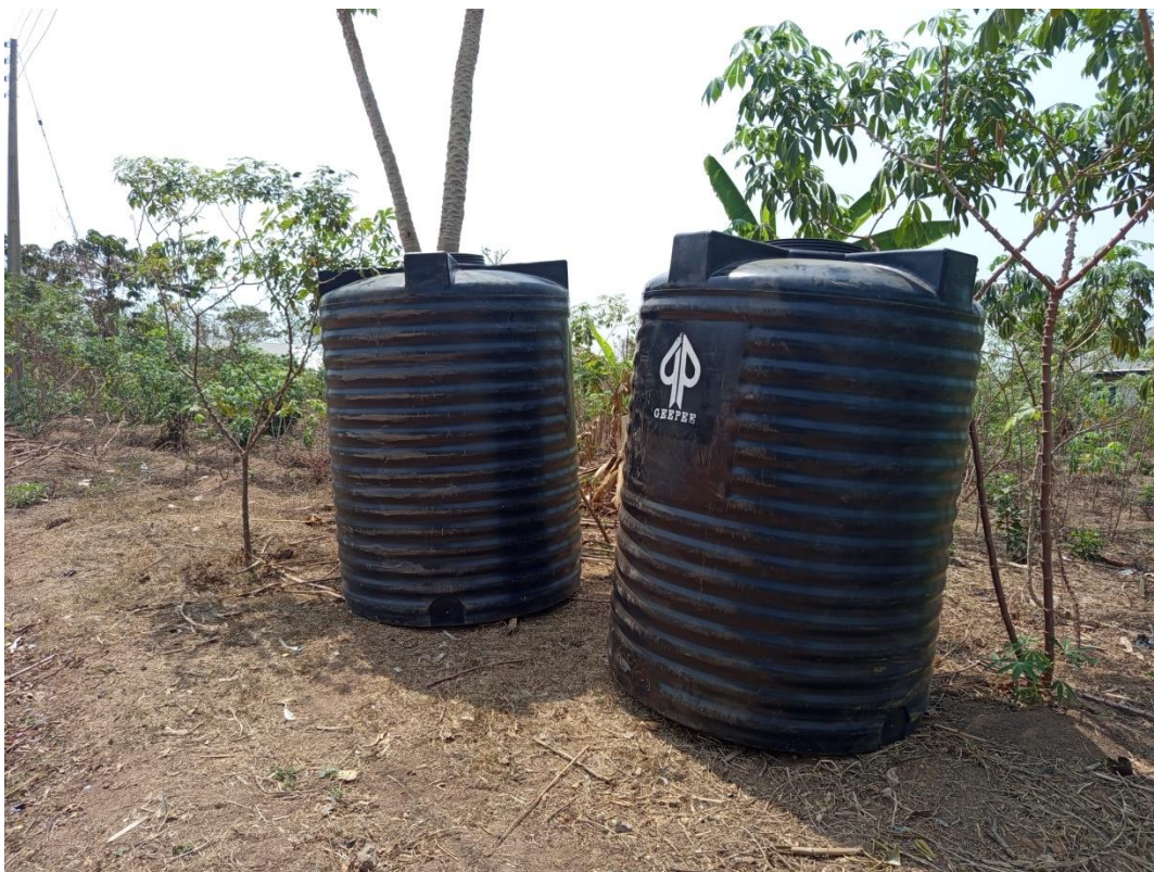
2000 liters Water Tanks purchased