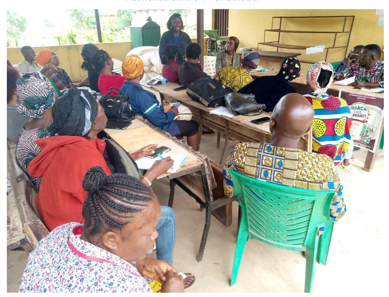
Do you harvest rainwater? If not, start today!

Dear Donors, Partners, Friends, and Supporters of OMITIDE,