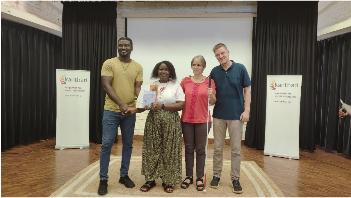
Certificates were issued for participation in the entrepreneurship and social aspects of the training.